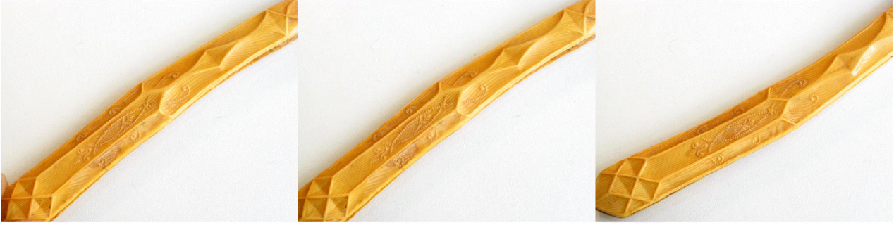
89. THE GREATER CHICAGO on left tang and Kraut & Donhal, Chicago Ill Made in Germany on right. Beautiful cream double bolstered ivory style celluloid handles, pins intact. Sharp Shaver. Pre 1930.