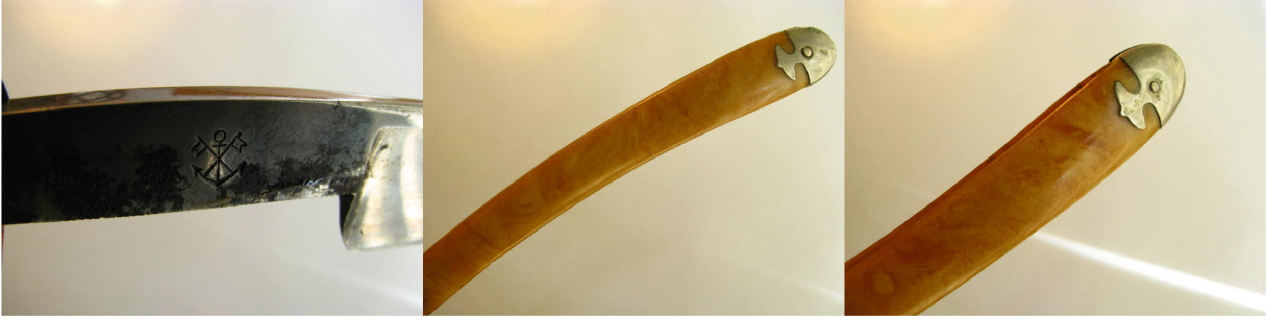
43. "The 1066" TEN SIXTY-SIX, in gold wash on the blade and "The 1066" Full Hollow Ground, on the left tang. Finest Silver Steel Forged and Real Hollow Ground in Germany, on the right tang. Top and bottom jimbs. 3 pin. Heavy composite handles, only a TOR on the tail. Like New.