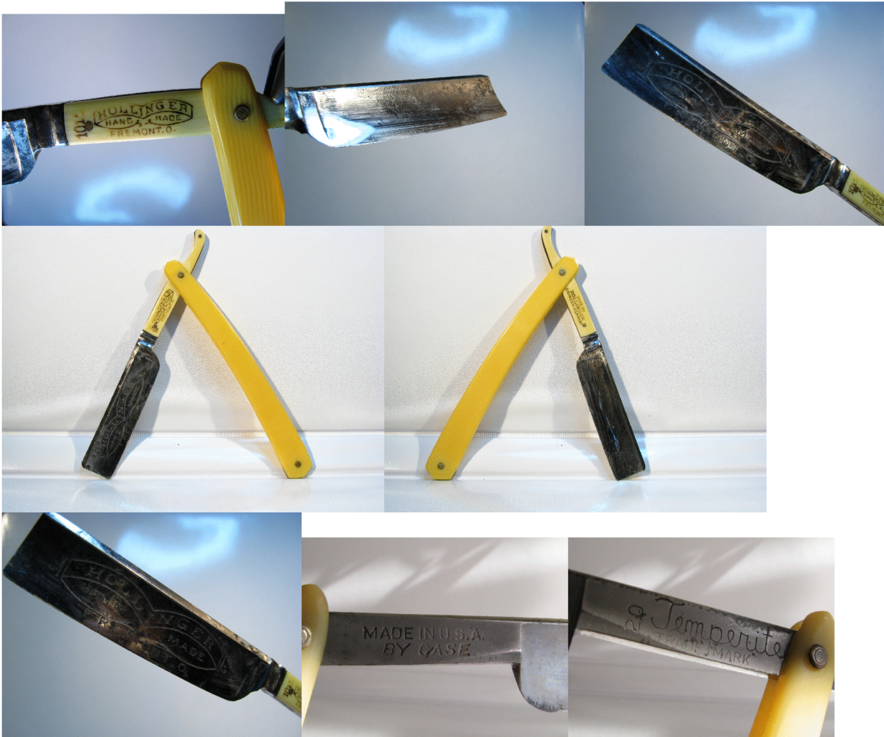
139. 20 TEMPERITE on left tang. MADE IN U.S.A. BY CASE on the right. SET IN NICE SOLID CREME CELLULOID HANDLES. MINOR TARNISH BUT SHARP. VERY LITTLE HONING OR WEAR.